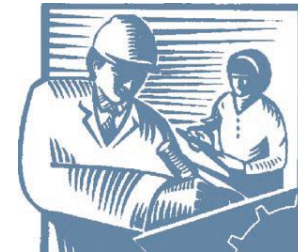
Industrial Assessment Center